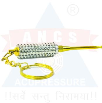
ANCS SUJOK JIMMY KEY CHAIN METAL SPRING POINT