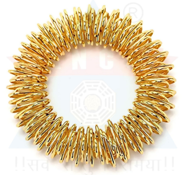
ANCS SUJOK LEG RING