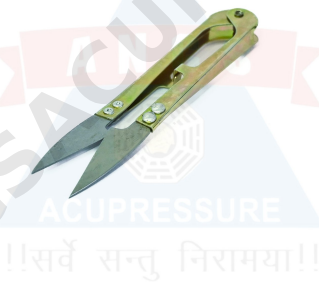
ANCS SUJOK PAPER TAPE CUTTER