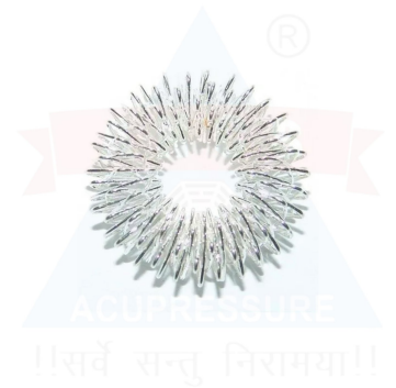
ANCS SUJOK FINGER MASSAGE RING - SILVER