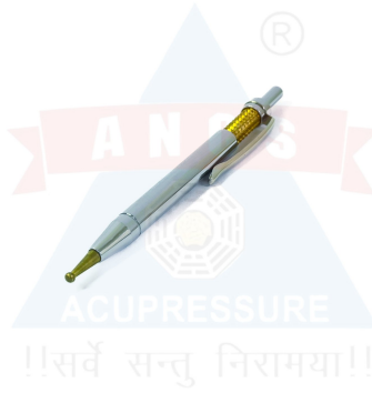
ANCS SUJOK ACUPRESSURE MAGNETIC PEN PROB