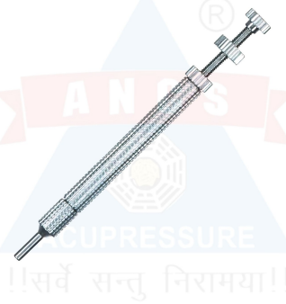
ANCS SUJOK NEEDLE INSERTER