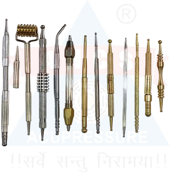
ANCS SUJOK THERAPY JIMMY KIT SET - 11