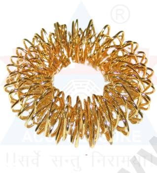
ANCS SUJOK FINGER MASSAGE RING - GOLD