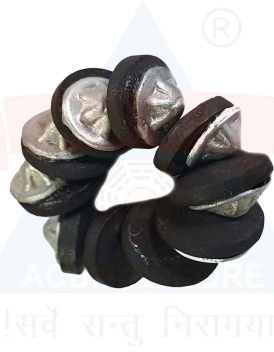
ANCS SUJOK STAR MAGNET - 10 PC