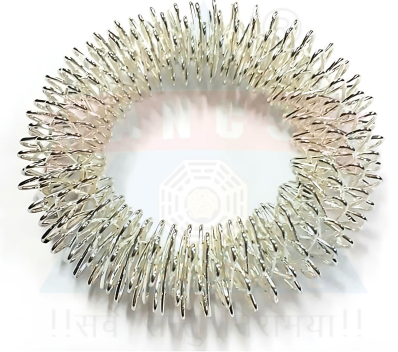
ANCS SUJOK RING - THREE FINGER MASSAGE