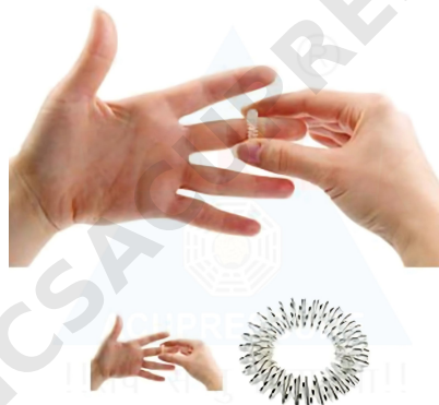
ANCS SUJOK FINGER MASSAGE RING SUPER MAX