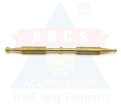
ANCS SUJOK JIMMY BRASS CUT