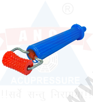
ANCS ACUPRESSURE SUJOK MINI ROLL FINGER MASSAGER