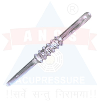
ANCS SUJOK JIMMY SHINY CRYSTAL