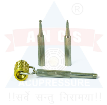
ANCS ACUPRESSURE SUJOK MINI ROLLER