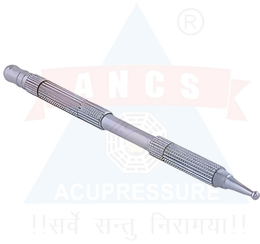
ANCS SUJOK JIMMY 5 IN 1