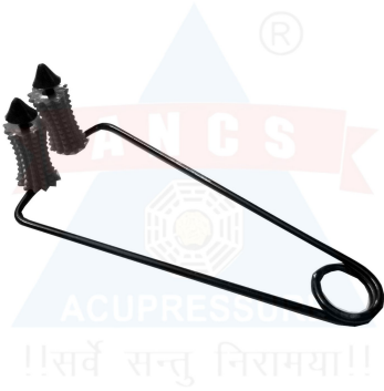
ANCS SUJOK FINGER MASSAGER