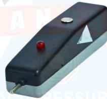
ANCS SUJOK POINT DETECTOR ACUPRESSURE POINT FINDER