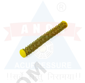
ANCS RING SPRING ROLL